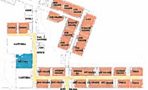
ELEMENTARY FIRST FLOOR PLAN