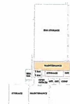
OPERATIONS FACILITY FLOOR PLAN