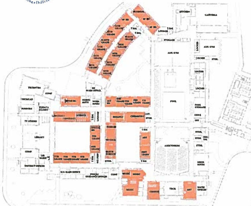
HIGH SCHOOL/MIDDLE SCHOOL FIRST FLOOR PLAN